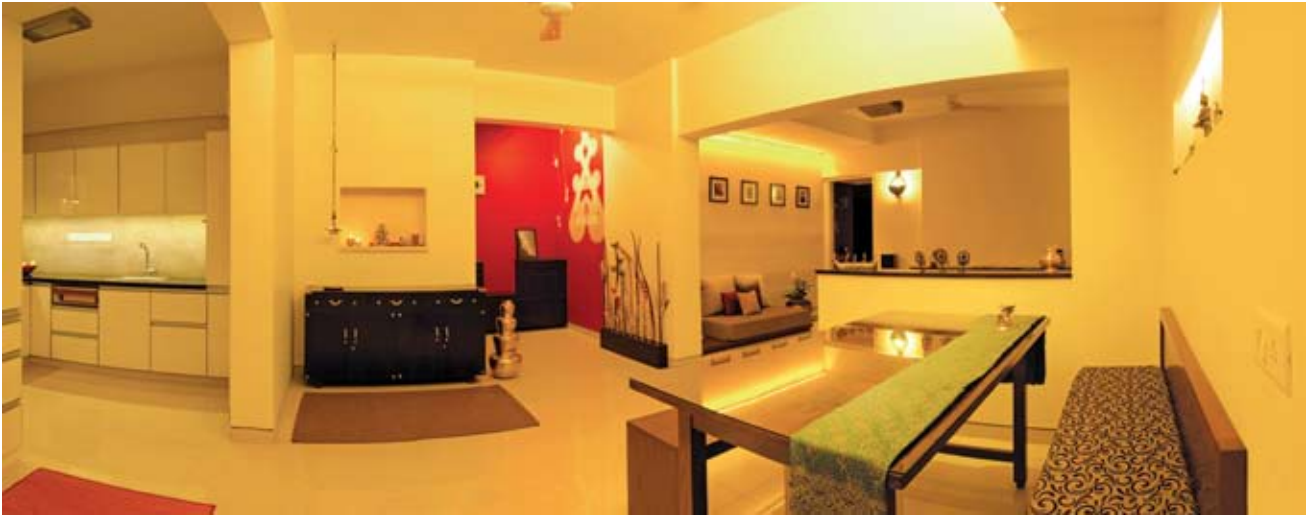
A panoramic view of the apartment makes it appear spacious.

feel spacious and engage with the outdoors. The civil changes included shifting and extending certain walls of the kitchen and master bedroom, and converting the guest bedroom into a study. A low wall was introduced into the large existing hall to create a subtle divide defining the living and dining spaces.