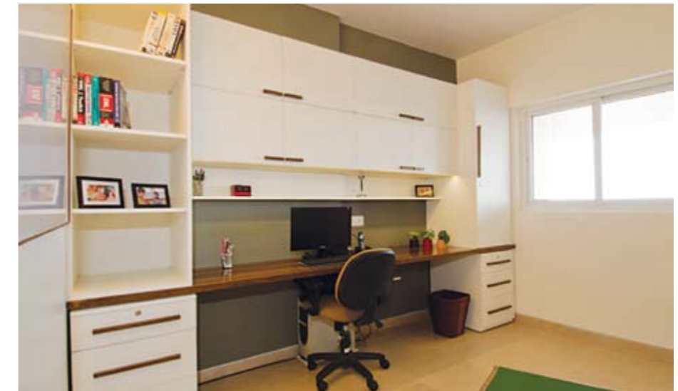
The third bedroom was converted to a home office/guest room, utilising the limited space.