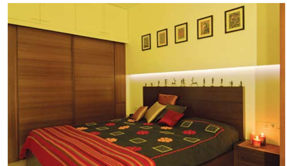
The simply attired master bedroom has generous storage space and the combination of art and fabric colours makes it cosy.

besides the structural complexities, were challenging. The beams were enormously deep and broad, projecting far beyond the lines of the walls at very odd and unexpected places. The columns were tremendously wide and occupied a large part of the wall surface, making it an arduous task to chase and integrate the electrical and plumbing layouts. PSR's design process embraced the panoramic view and natural breeze. The interior spaces were remedied to make the apartment