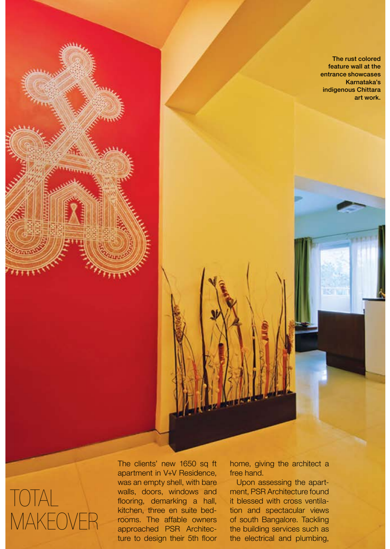
The rust colored feature wall at the entrance showcases Karnataka's indigenous Chittara art work.

And finally, crystal ball gazing: 'We have strong ambitions. We are looking to expand and diversify our practice and undertake a larger spectrum of work both in scale and scope. We would like to have projects which challenge our design ambitions, including pro bono work, as part of our portfolio and forge ahead with a strong focus on technology and sustainable design,'