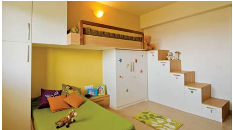
The children's bedroom is conducive to playing and studying, while providing individual space on different levels for each child.