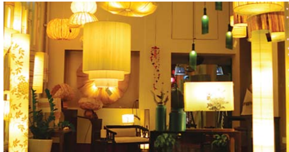
A room with a view attracts passers-by.

The alteration shows the eye-catching exterior of the showroom, transformed from the original dilapidated residence.