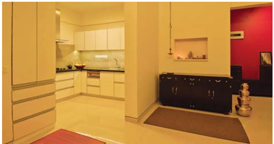
The refurbished, high specification kitchen opens onto the dining space.