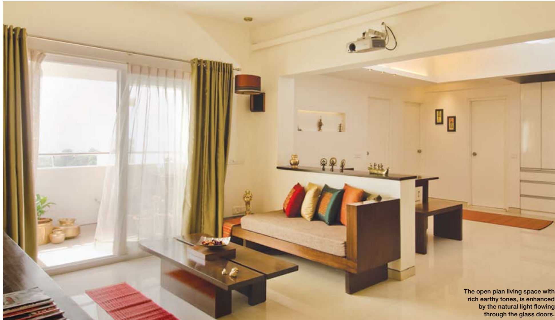
The open plan living space with rich earthy tones, is enhanced by the natural light flowing through the glass doors.