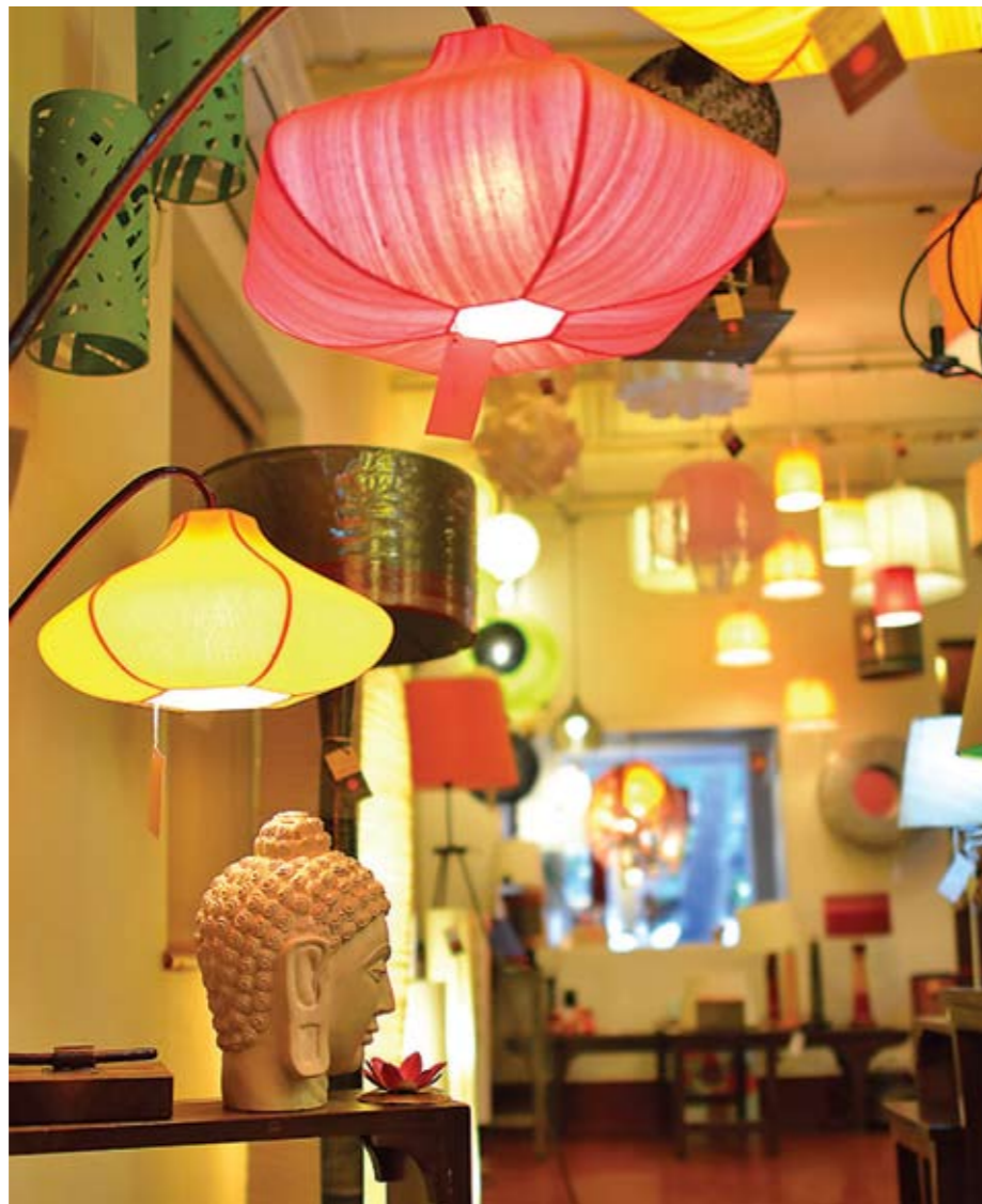
The previous living and dining areas were combined to form a single expansive space in order to showcase the spectrum of lights.

The existing home comprised a living, dining, kitchen and two bedrooms with a shared bathroom. The shell and internal load bearing walls were 15" thick. There were small window casements which let minimal natural light enter, thereby causing the internal spaces to be rather dark and uninviting. It was detached from the surroundings and had no connectivity to the outside. Furthermore, the groundscape was rough-hewn and was