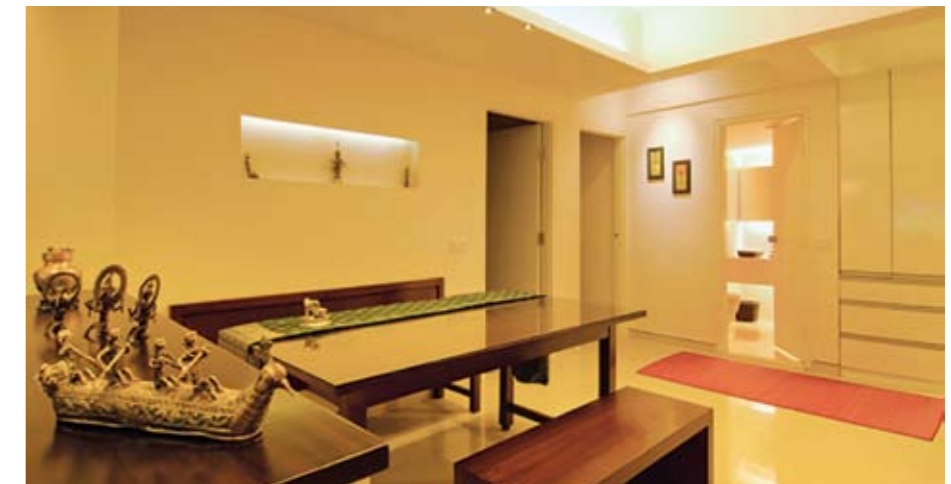
The open plan dining space seemingly flows from the living area, yet maintains its privacy with a low ledge.