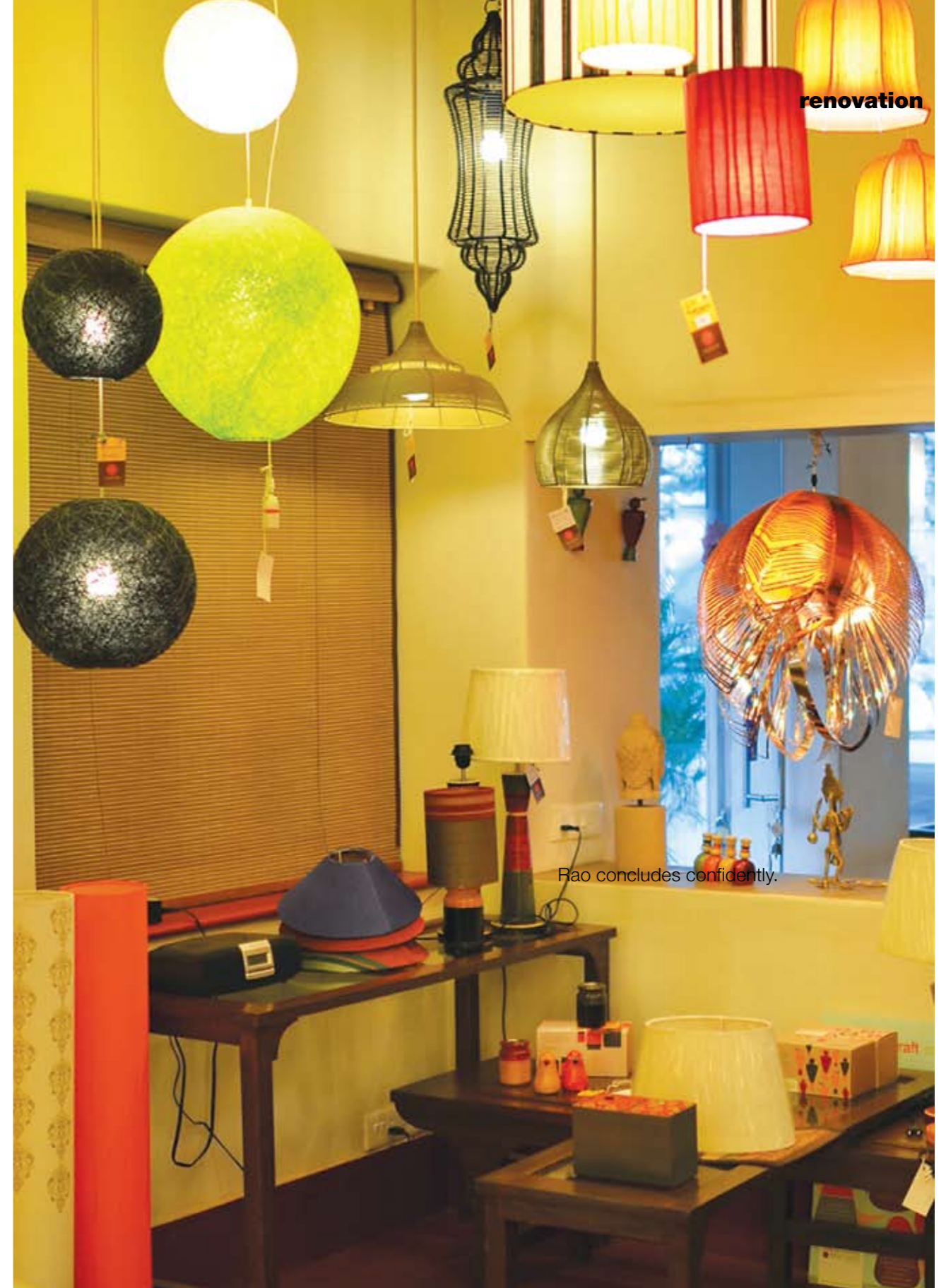
Rao concludes confidently.